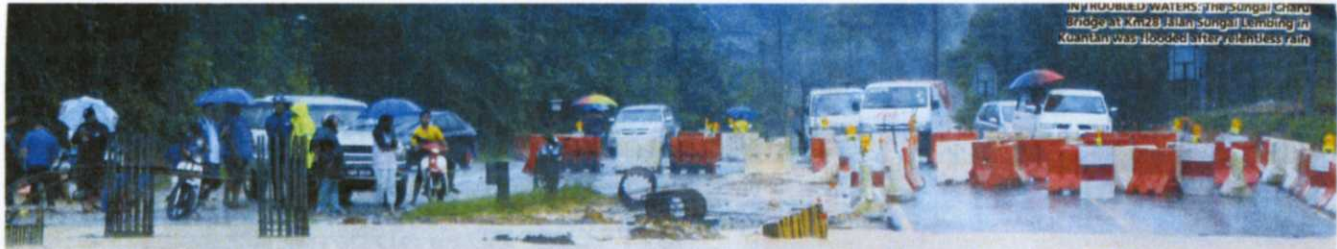
IN FLOODING WATERS: The Sungai Charu Bridge at Km28 Jalan Sungai Lembing in Kuantan was flooded later, rainless air